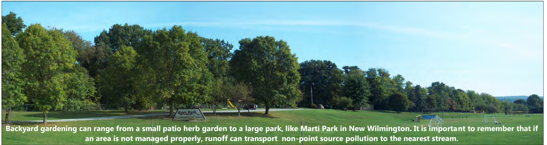
Backyard gardening can range from a small patio herb garden to a large park, like Marti Park in New Wilmington. It is important to remember that if an area is not managed properly, runoff can transport non-point source pollution to the nearest stream.