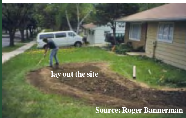
lay out the site

15 feet 15 feet 1/4 of the roof drains to one downspout = 15' x 15'