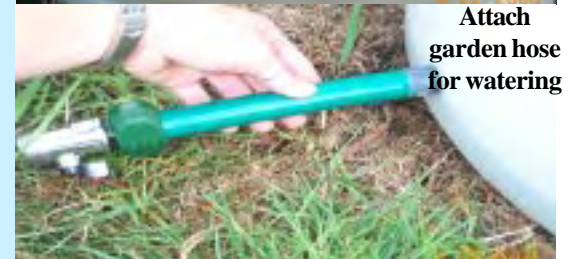
Attach garden hose for watering