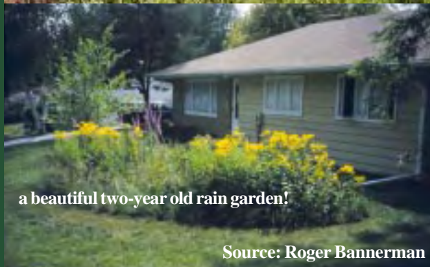
a beautiful two-year old rain garden!