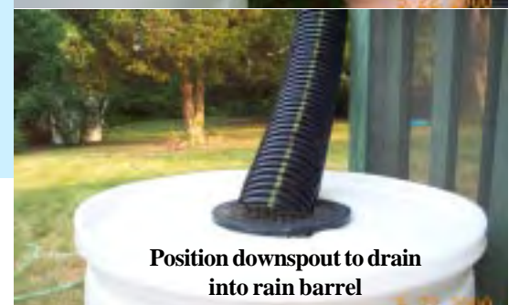
Position downspout to drain into rain barrel