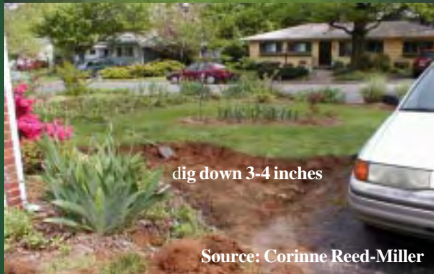
dig down 3-4 inches