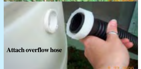
Attach overflow hose